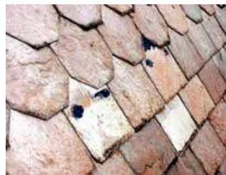
Slate hooks attach new slates without damaging the roof