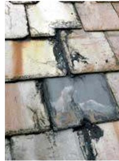
Two example of poorly executed slate repairs

If the slate inspection or repair is scheduled after all the leaves have fallen, the crew can also clean and inspect the gutters.