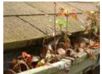
Leaves left to sit in gutters can create an environment that encourages new plant growth.

one of the many systems available can be confusing. Take a look at our website, call our office for a free estimate or stay tuned to future newsletters to learn the pros and cons of each of the three systems that Holencik Roofing currently offers: Gutter Stuff, Gutter Tunnel, and Leaf Proof.