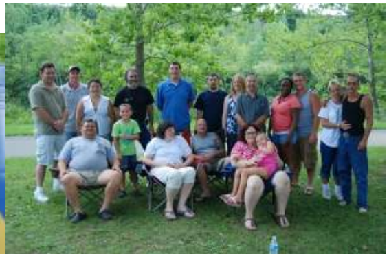
Group shot at the end of the day