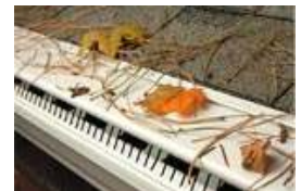
Leaf Proof with Channel Guard